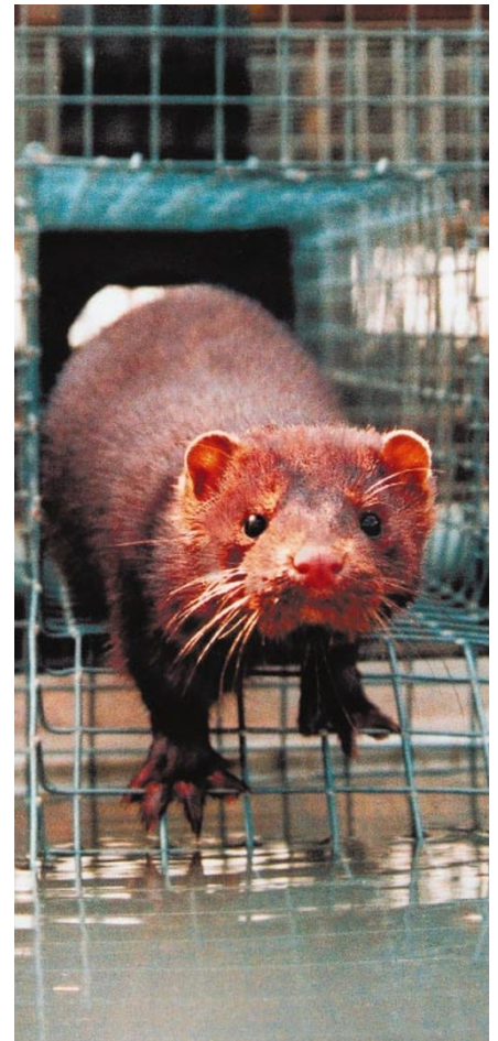
Figure 1 A caged American mink ( Mustela vison ). This one has access to a water pool, a highly valued resource enabling the animal to indulge its natural instinct for diving and swimming.

We next tested the reactions of seven male and seven female mink to having their access blocked to four resources, for 24 hours each, by monitoring their levels of cortisol, which is produced in response to stress 8 . The resources chosen were of high, intermediate or low value, as judged by the cost the animals would pay to reach them (the water pool, alternative nest site or empty compartment, respectively), and the fourth was an